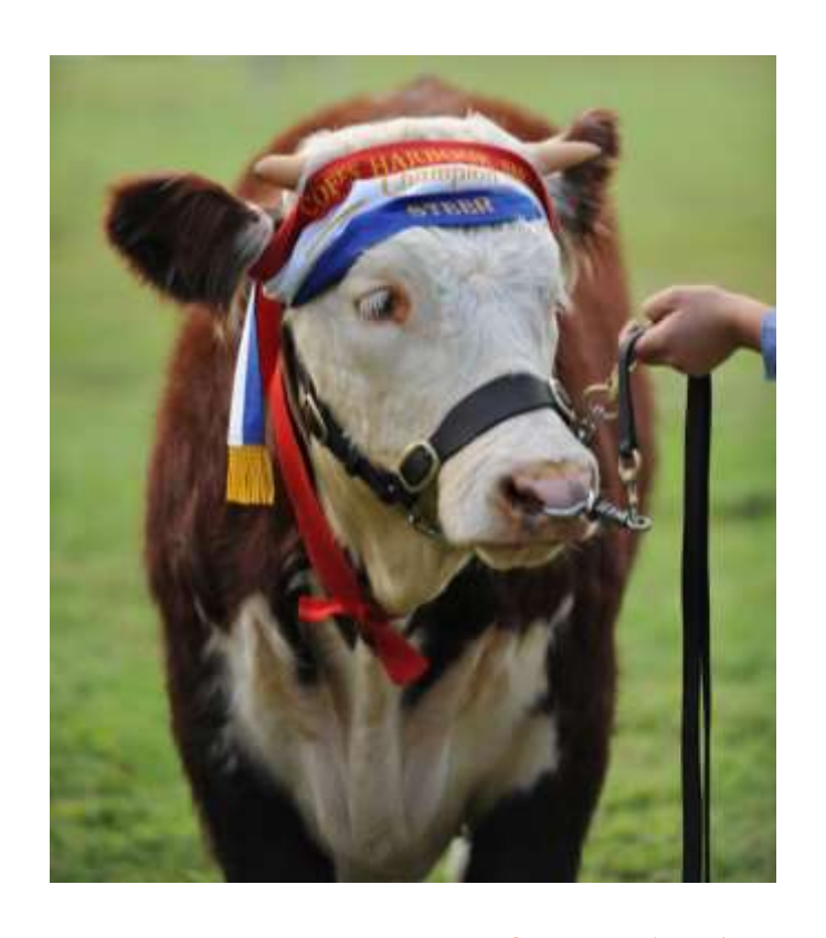
Supreme Beef Exhibit Sponsored by Ray Donovan Stock & Station Agents

Open Steer Sponsored by Charlinda Poll Herefords